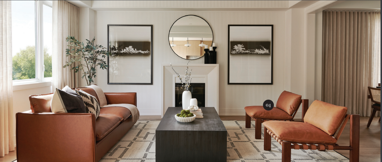
Images for inspiration purposes only and may depict additional upgraded features. All as per Vendor's standard selections. E.&O.E.